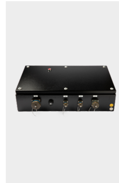
ELECTRONIC BOX WITH CONNECTORS

bellows against dust and sand in different colours, ice spacers for using the mast at low temperatures, anti-freeze liquid for preventing the creation of ice layers on the tubes and for melting it, etc.